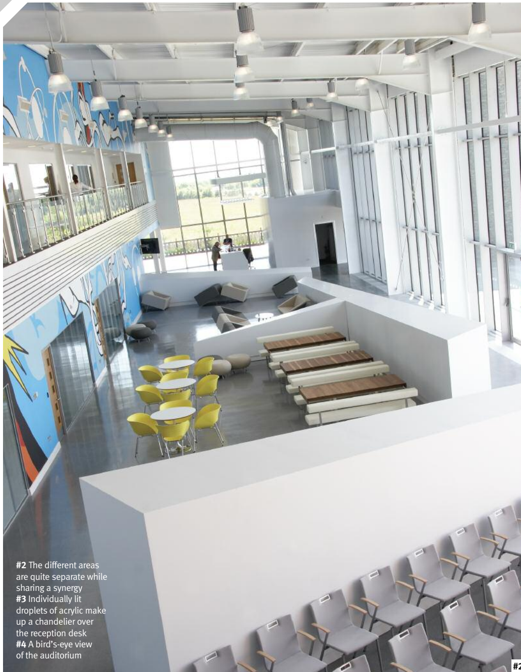
#2 The different areas are quite separate while sharing a synergy #3 Individually lit droplets of acrylic make up a chandelier over the reception desk #4 A bird's-eye view of the auditorium